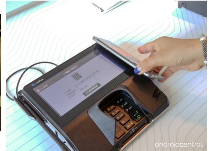
magnetic stripe emulation